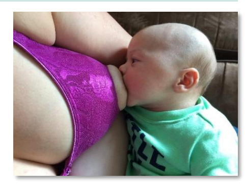
A bra with a cut out area can support the weight of the breast.