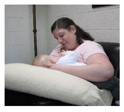
When commercial nursing pillows do not fit, try bed pillows to support your arm.