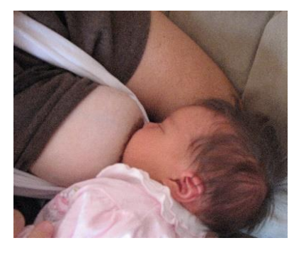
A sling can hold the weight of your breast for the baby.