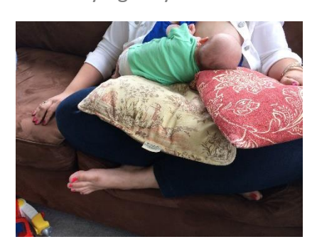
Sitting cross-legged with lots of pillows under the baby is another possible position.