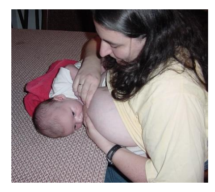
Your hands are free to hold the breast when your baby is resting on a padded table.