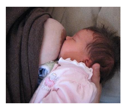
Try a small rolled towel to support your breast.