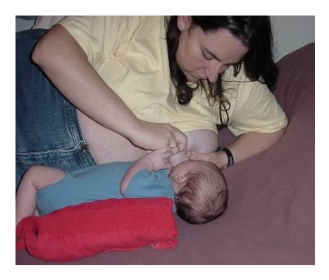
Find positions where your breast and your baby are both supported, such as lying on your side.

Find a position that supports both your breast and your baby so your hands are free to hold the end of your breast into the baby's mouth.